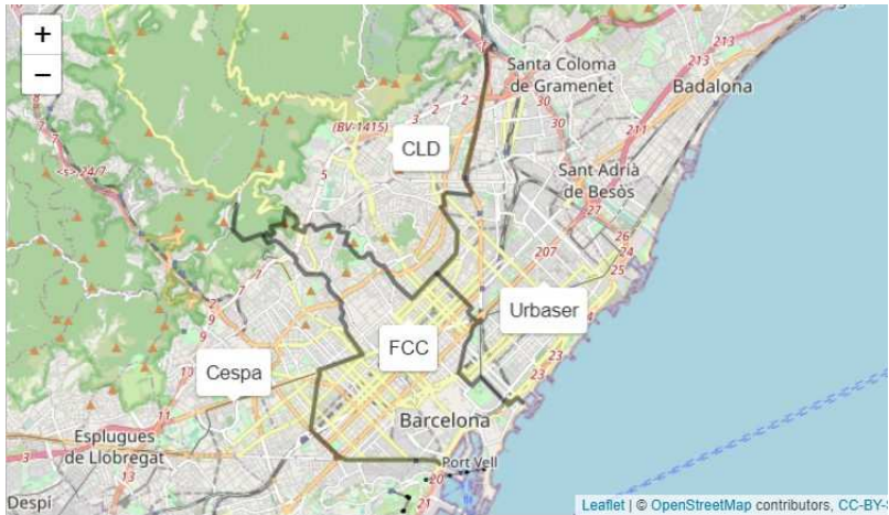
Figure: Waste Collection in Barcelona